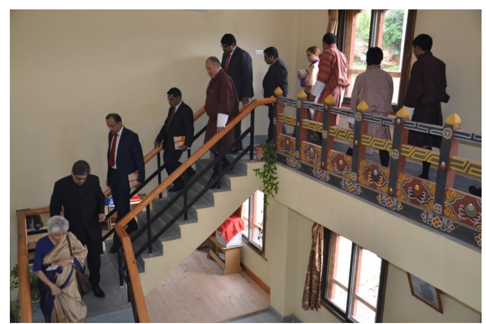
High level Indian Delegation after visit to FoTM Library

a) High level delegation led by the Secretary, Ministry of External Affairs, Government of India visited the Institute in September 2014 and inspected the infrastructure developed with GOI assistance