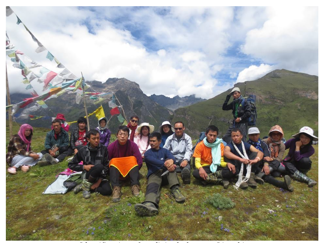
Identification of medicinal plants at Lingshi

a) As per the curriculum, 3rd semester Drungtsho and 3<sup>rd</sup> semester sMenpa trainees along with a lecturer went to Lingzhi in August 2014 for the identification of high altitude medicinal plants/herbs.