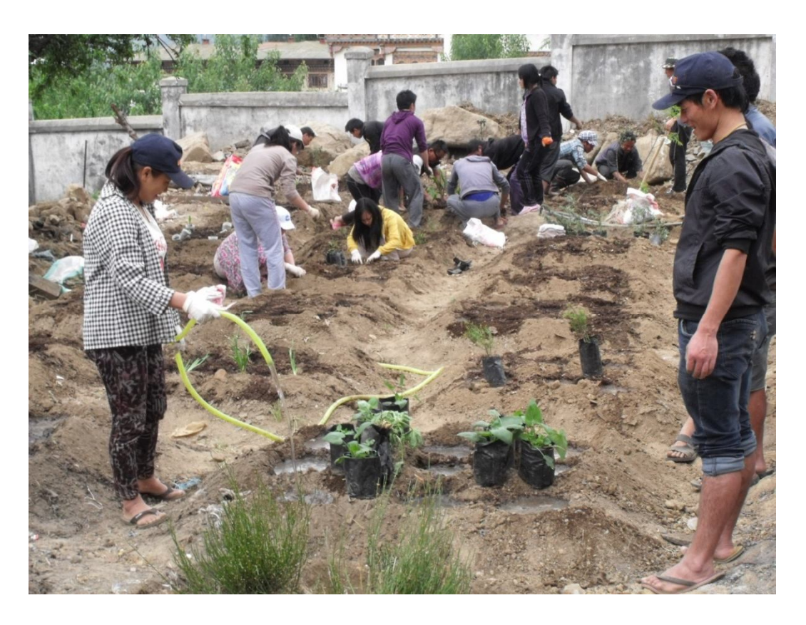
FoTM students planting the saplings