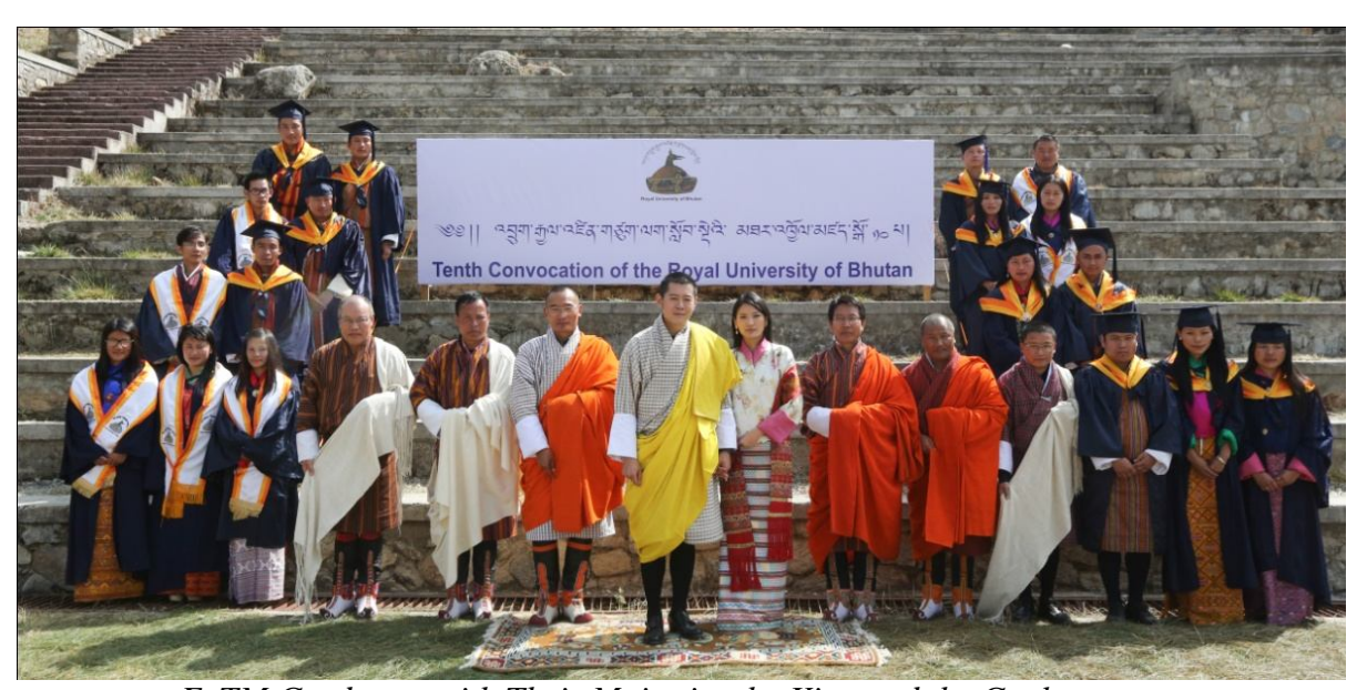
FoTM Graduates with Their Majesties the King and the Gyaltseun