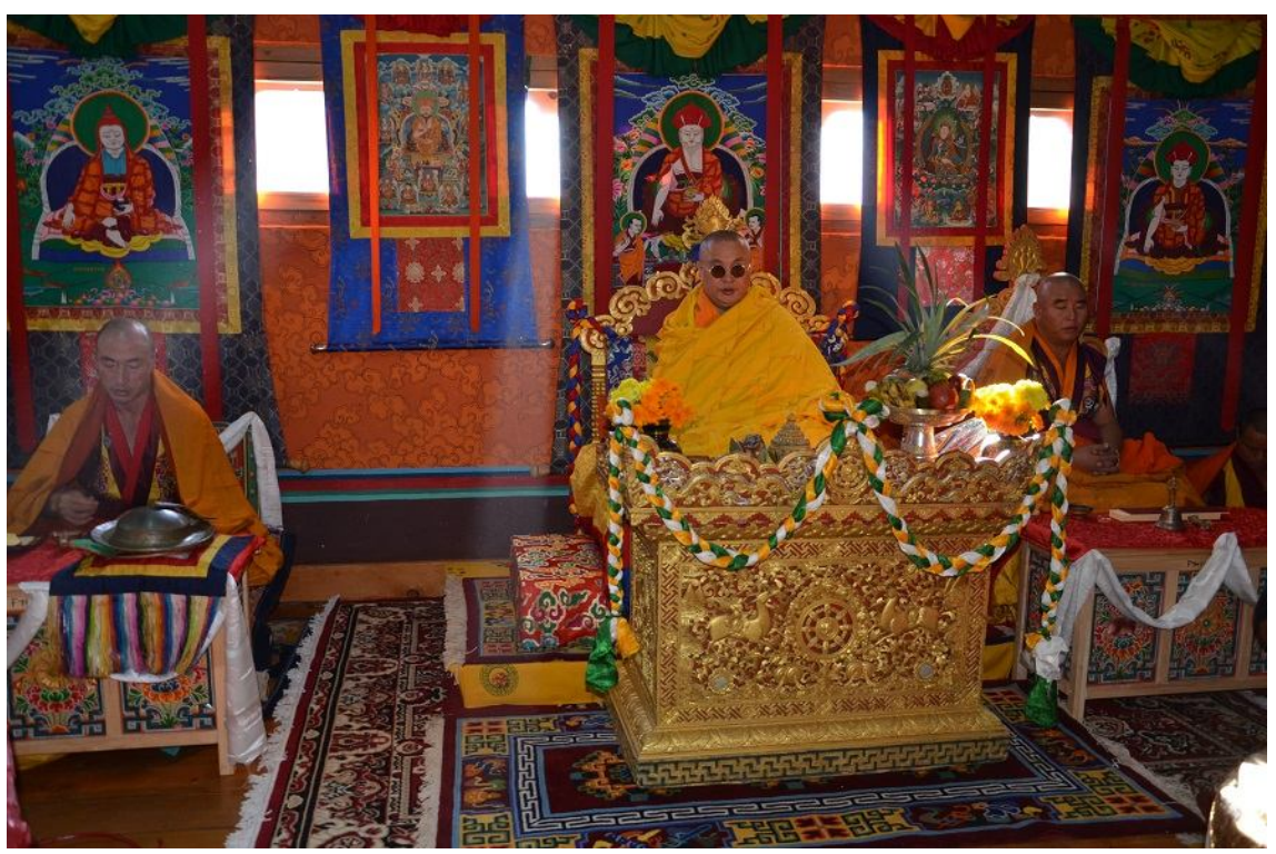
His Holiness presiding over the Consecration Ceremony